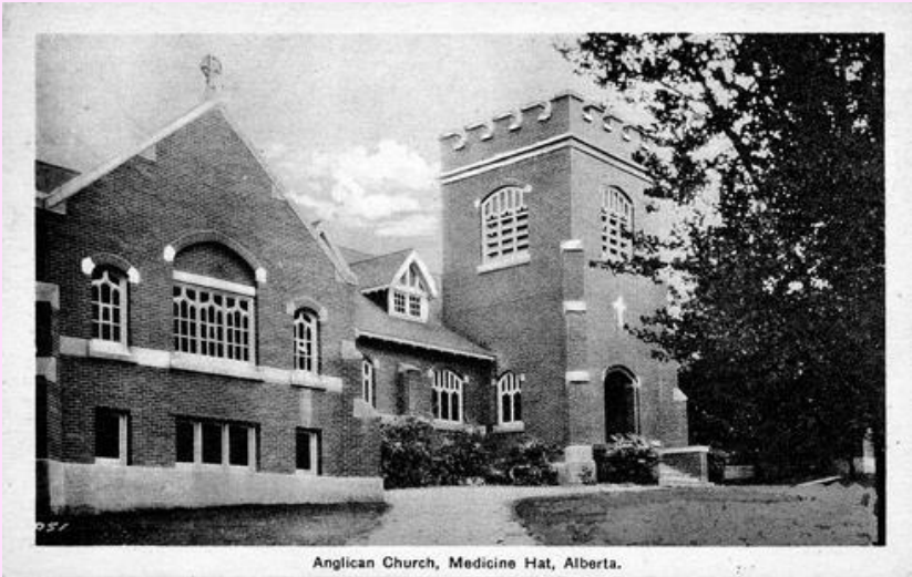
Anglican Church, Medicine Hat, Alberta.