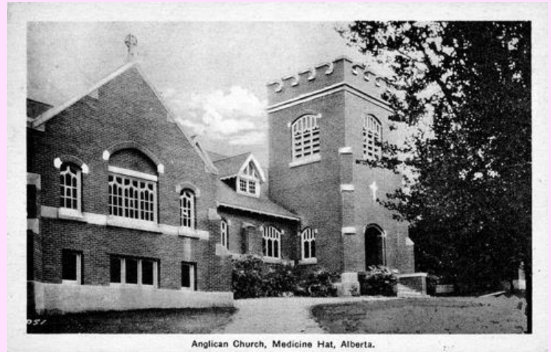
Anglican Church, Medicine Hat, Alberta.

The Medicine Hat Ecumenical Campus Ministry